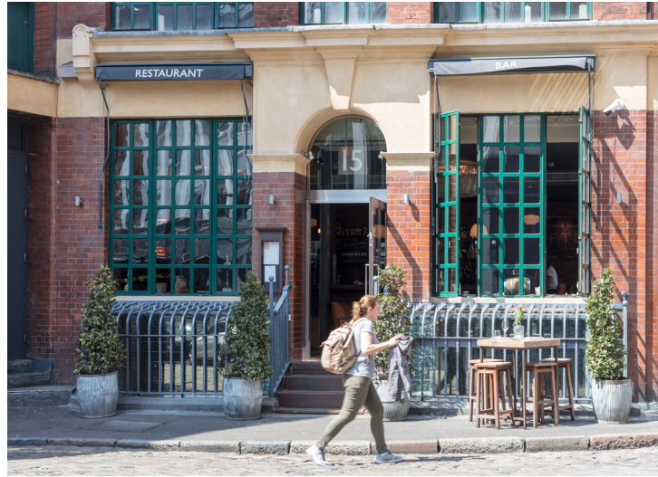
Jamie Oliver's Fifteen