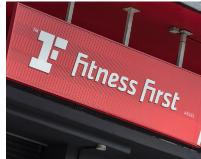
Fitness First Angel