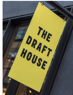
The Draft House