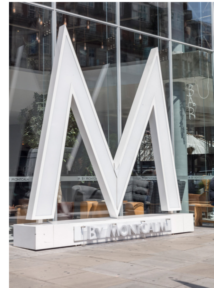
M by Montcalm London Shoreditch